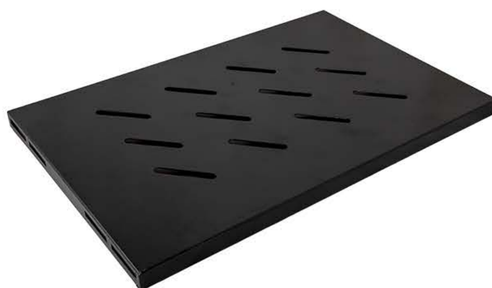
Ventilated Fixed Shelves