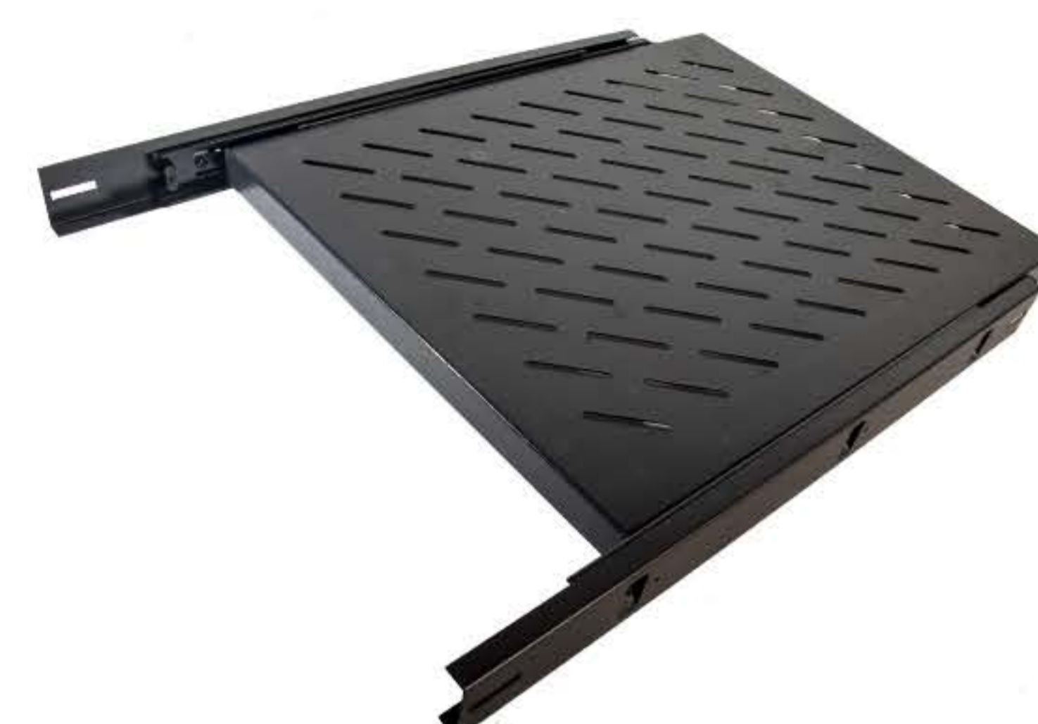
Ventilated Sliding Shelves