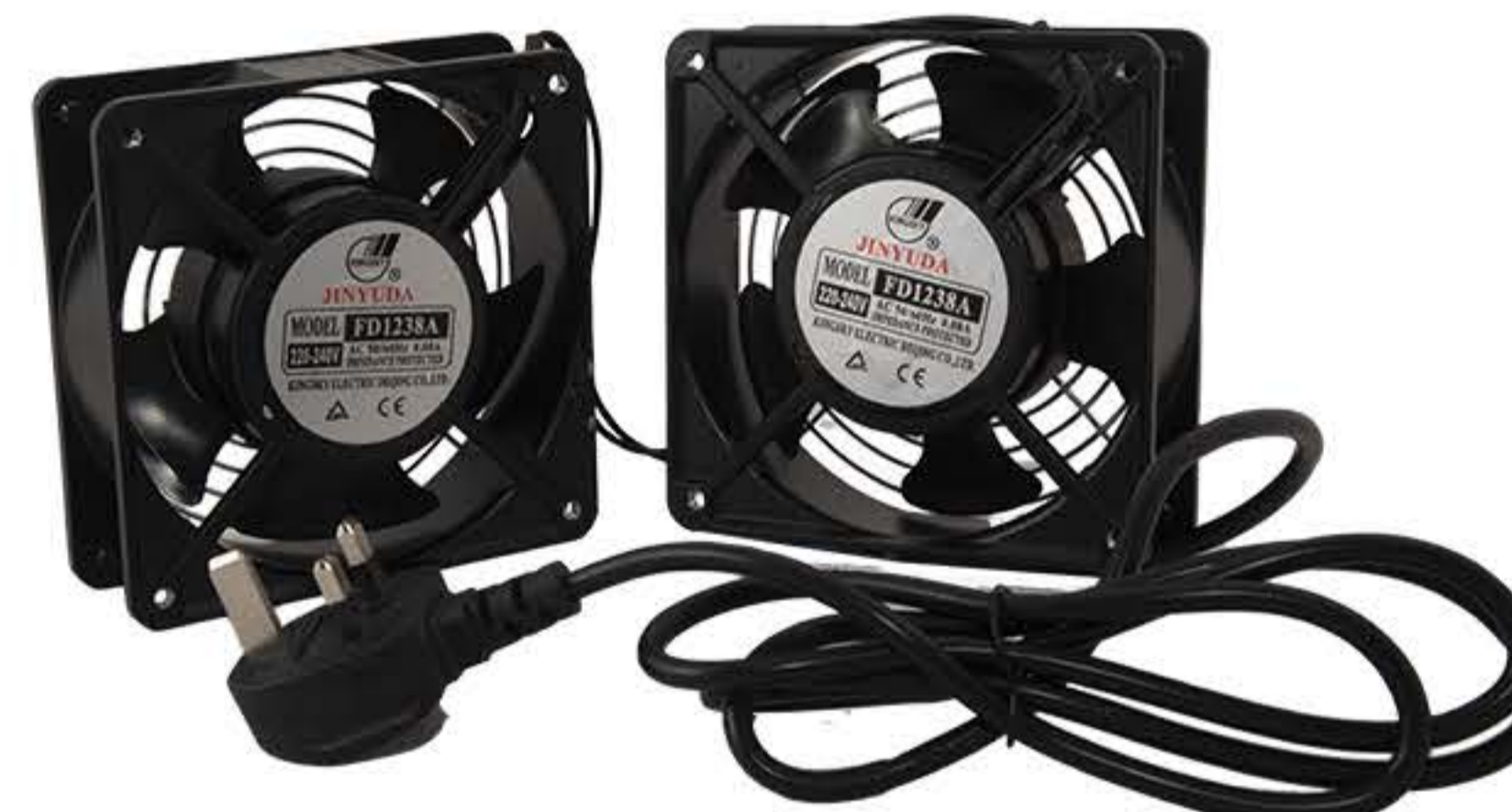
Double Fan 230V