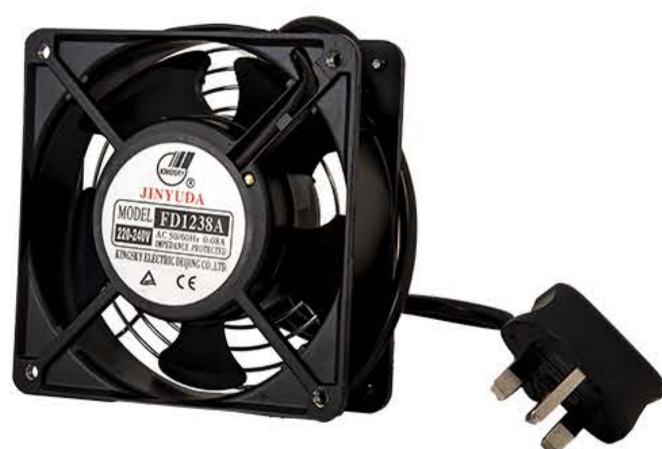
Single Fan 230V