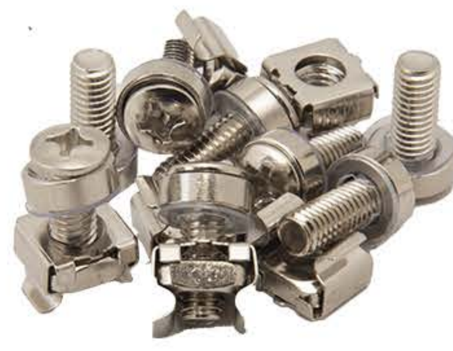
Cage Nuts & Washers