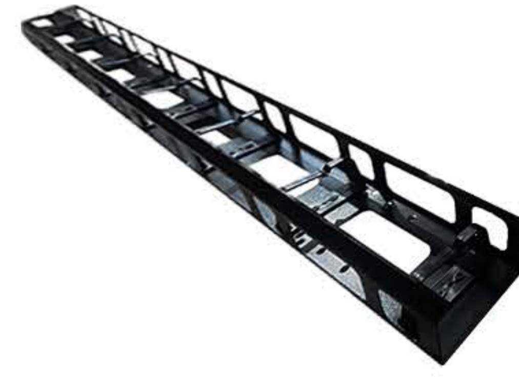
Cable Management Panel