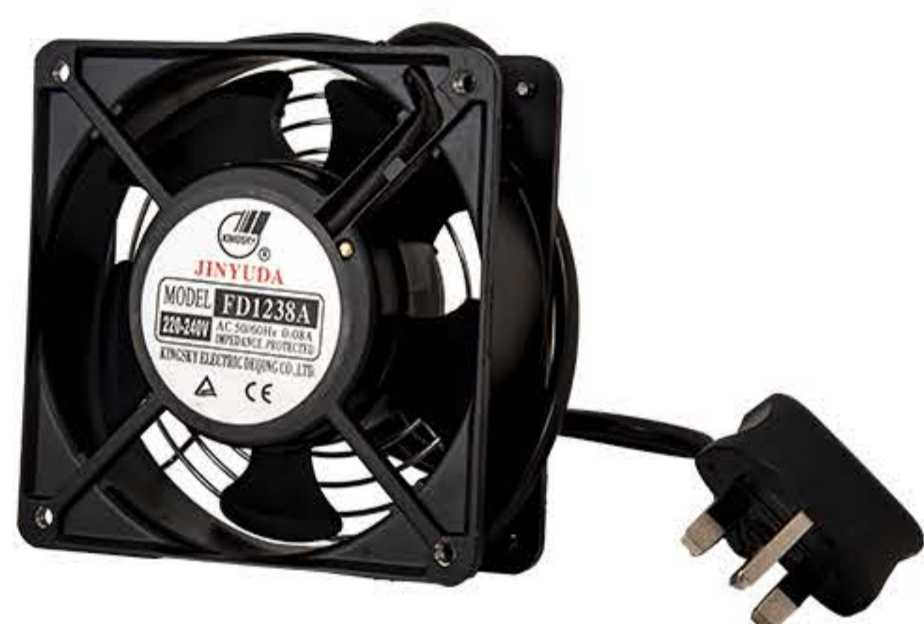
Single Fan 230V