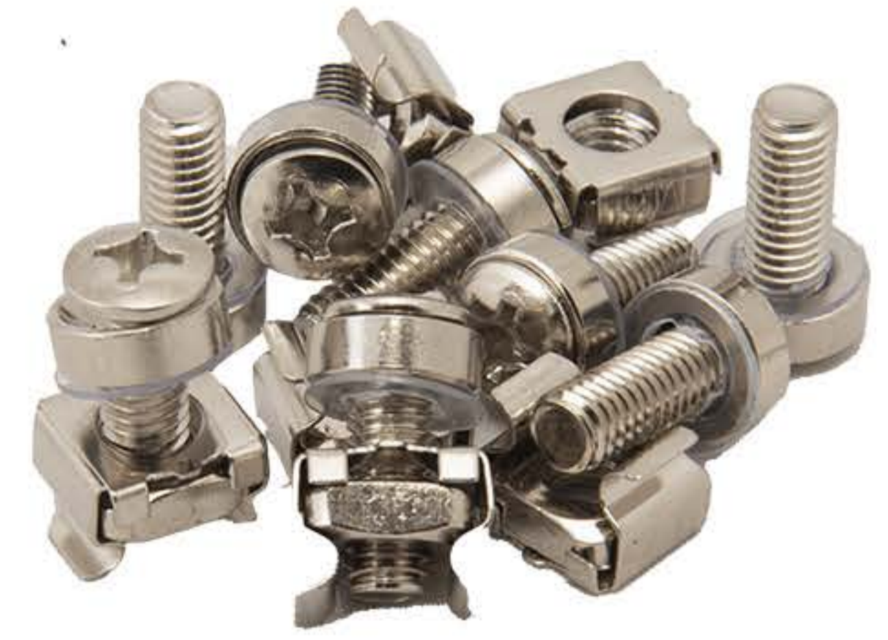
Cage Nuts & Washers